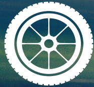
Flat Tire Assistance